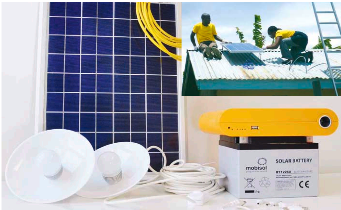
Solar Home Systems Kit with solar panel and equipment