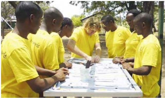
Mobisol educating local technicians