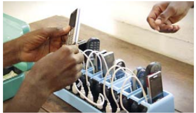
Charging device for mobile phones

and does not charge the customers for the installation of the SHS kit at all.