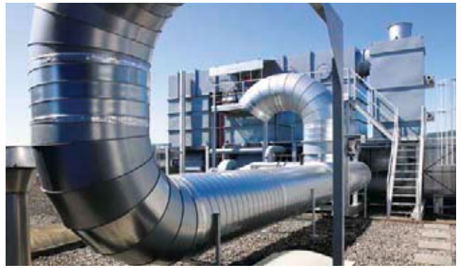
Regenerative Thermal Oxidation