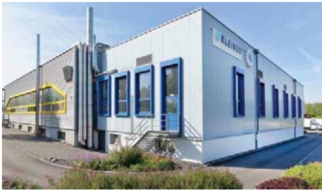
O. KLEINER AG production facility