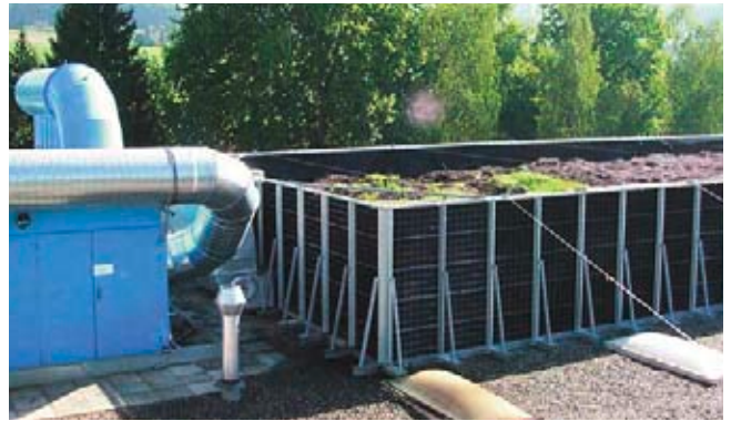
Biofilter plant on the factory roof