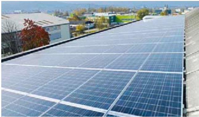
Photovoltaic solar panels